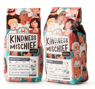
Kindess and Mischief