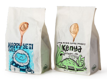
Brandywine Coffee Roasters Bags are hand painted and wax stamped by Brandywine Roasters.