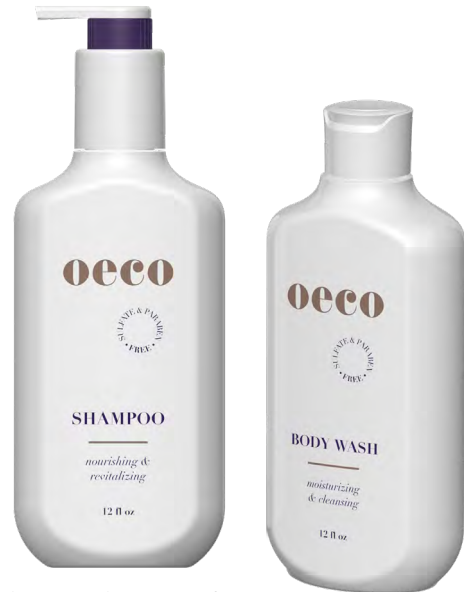
Bottles shown with 28-410 closures

This customizable flip-top not only addresses the need for a sustainable solution, but it is also ecommerce capable . The closure maintains the same neck finish as the 100% polyethylene pump to minimize the total bottle types needed.