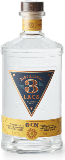
Distillerie 3 Lacs