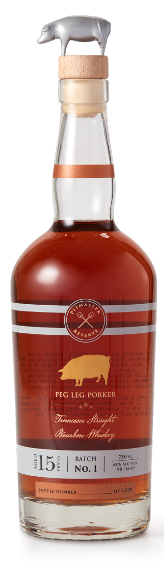
Peg Leg Porker