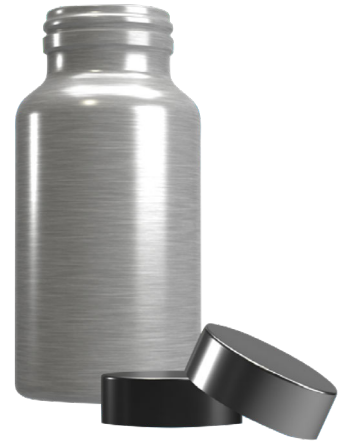
38-400 WIDE MOUTH BOTTLE