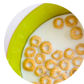
DAIRY & DAIRY ALTERNATIVES