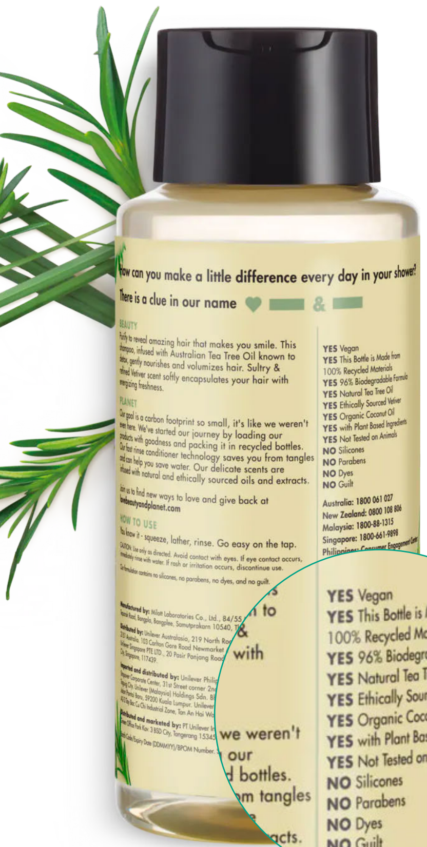
Love Beauty and Planet

The consumer demand for safe, effective, and eco-conscious products has given rise to a personal care trend known as Clean Beauty . Brand transparency is the foundation of Clean Beauty. Purpose-driven brands have demonstrated that quality products can be produced without harmful ingredients and utilize three key aspects of their packaging design to communicate their response to these values.