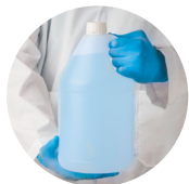
REFILL & CONCENTRATES